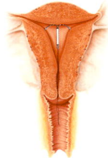
Mirena in place in the uterus